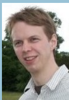
Assistant Professor of Finance, University of Michigan

Many studies have shown that family firms perform differently from non-family firms. However, only recently have scholars started opening the black box of why family firms are different by focusing on families' special contribution to their firm.