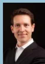
Associate Professor of Finance, Bocconi University, Italy